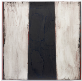
Stele Series LXVIII, 2.22.88, 1988 Acrylic, ink, and graphite on Mylar 60 x 60 inches / 153 x 153 cm #CG103 Price: $15,000

EXHIBITION CHECKLIST (clockwise from entrance)