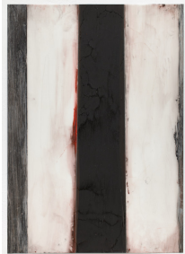
Stele Series LXIV-A, 1.10.89, 1989 Acrylic, ink, and graphite on Mylar 20 x 14.25 inches / 51 x 36.2 cm #CG104 Price: $4,000