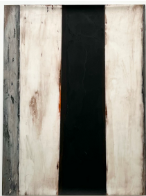
Stele Series LXIII, 1.9.89, 1989 Acrylic, ink, and graphite on Mylar 60 x 45 inches / 153 x 114 cm #CG106 Price: $13,000