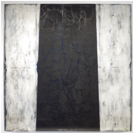
Stele Series LXIV, 2.22.88, 1988 Acrylic, ink, and graphite on Mylar 120 x 120 inches / 305 x 305 cm #CG105 Price: $40,000 (reserved for museum collections only)