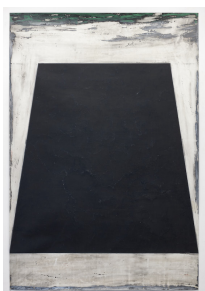
Mastaba Series XVII, 5.29.87, 1987 Acrylic, ink, and graphite on Mylar 88.5 x 60 inches / 225 x 153 cm #CG108 Price: $19,000