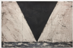
Delta Series, Aurora II, 10.26.83, 1983 Acrylic, ink, and graphite on Mylar 48 x 73.5 inches / 122 x 187 cm #CG77 Price: $15,000