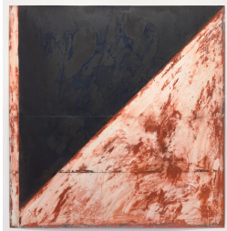
Pegasus Series, Uranus II, 9.30.85, 1985 Acrylic, ink, and graphite on Mylar 96 x 93 inches / 244 x 236 cm #CG71 Price: $25,000 (reserved for museum collections only)

EXHIBITION CHECKLIST (clockwise from entrance)