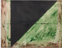
Pegasus Series, 8.28.83, 1983 Acrylic, ink, and graphite on Mylar 48 x 62 inches / 122 x 158 cm #CG76 Not For Sale