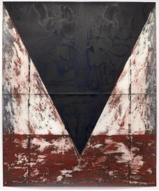
Delta Series VIII, 2.25.85, 1985 Acrylic, ink, and graphite on Mylar 108 x 90 inches / 274 x 229 cm #CG75 Price: $25,000 (reserved for museum collections only)