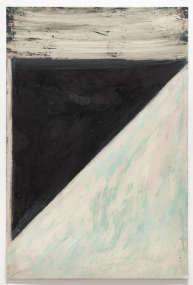
Pegasus Series X, 8.16.83, 1983 Acrylic, ink, and graphite on Mylar 36 x 24 inches / 91 x 61 cm #CG73 Not For Sale