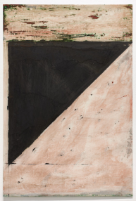
Pegasus Series, 8.12.83, 1983 Acrylic, ink, and graphite on Mylar 36 x 24 inches / 91 x 61 cm #CG72 Not For Sale