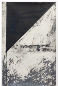
Pegasus Series, 3.1.85, 1985 Acrylic, ink, and graphite on Mylar 54 x 34.5 inches / 137 x 88 cm #CG74 Price: $12,000