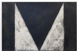
Delta Series, 1984-1987 Acrylic, ink, and graphite on Mylar 54 x 83 inches / 137 x 211 cm #CG79 Price: $16,000